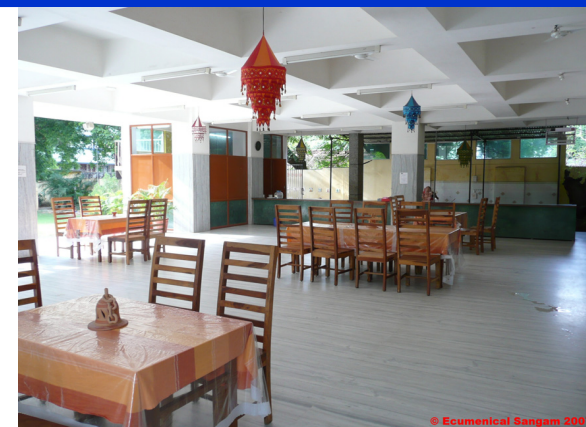
Multipurpose banquet hall