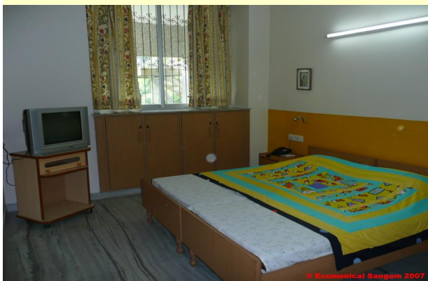
Your Home in Nagpur's Heart