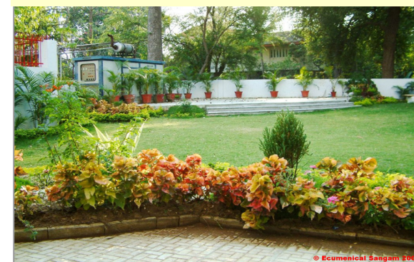
Picturesque garden and landscaped lawn