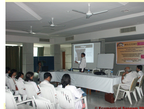
A/C Conference hall