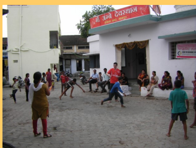
Summertime at Abika Nagar.

Between end of April and beginning of June CFSD conducted several "Summer Camps" in different locations in the city. Main goal was to engage children from slum areas to participate in a diversified programme during their summer break. The