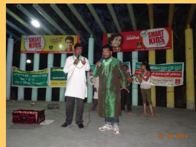
Street play about segregation of waste.

preparing compost at home and also on biogas plants. Main goal of the rally was to make people aware of Solid Waste Management. The route covered –All India Institute Local Self Government, Walmikinagar Campus to Coffee house square, Laxmi Bhavan square, and then Shankar Nagar and from Shankar Nagar to Ram Nagar Square. This event was followed by a street play about the segregation of waste at the childrens traffic park.