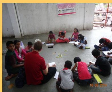
Summertime at Pawartoli.

programme included games, drawing, singing, sports, henna and cleanliness drive. The volunteers helped the staff members during the summer camps and played with the kids.