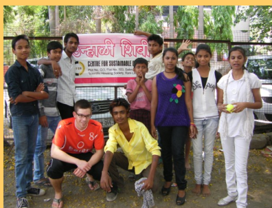
Summertime at Pitale Shastri Highschool.

Both volunteers, Maurice and Till, continued their self-defence-teaching in Municipal Cooperation School "Pitale Shastri". 20 students enjoyed the lessons until the start of the big summer holidays. On the last day the volunteers said goodbye to their students after 4 months of teaching and distributed some sweets.