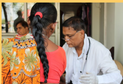
Health Camp: doctor with his patient.

the peer educators began to explain the causes and consequences of HIV/AIDS to a group that had gathered. Also the peer educator told them how to protect yourself and others from contracting the virus and other STIs. Free condoms and brochures were handed out to the workers.