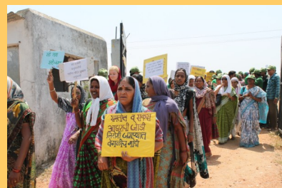
Rally on World Environment Day.

motto of this year's World Environment Day: Raise your voice, not the sea level! Furthermore, our director and our special guests held inspirational, motivating speeches on environmental protection and our contribution to a better tomorrow. In between the speeches, Awangari workers from our AWTC and MLTC projects in Lonara presented short self-written plays on environmental topics.